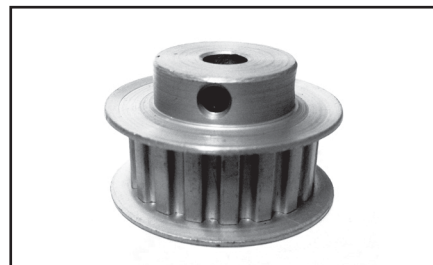
For XL pitch timing pulleys, see page 15.